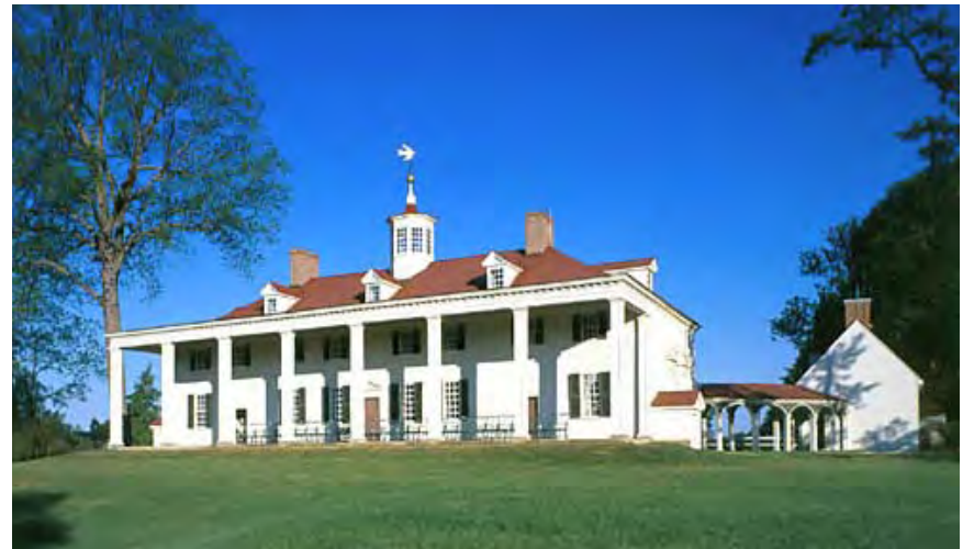
Mount Vernon, VA - looking toward the Potomac River

Act in 1969, it emerged from the tug and pull of legislative debate as an advisor to the President, and little more. "Stoporder" power and other authority originally proposed for the agency were left on the cutting room floor. From these humble beginnings, CEQ began to establish itself as the expert on NEPA's environmental impact review process by issuing informal guidance to other agencies following key decisions from citizen suits brought by environmental plaintiffs. In 1977, a Presidential executive order invested CEQ with the power to issue formal regulations for the NEPA process that emerged with such clarity and detail that they, along with case