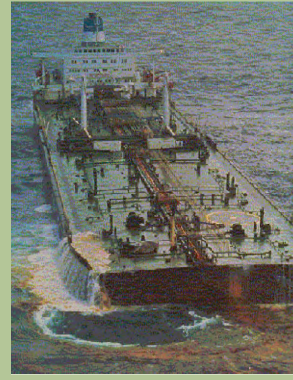
The Front Fell Off

Interviewer: Senator Collins? (trails off) Senator Collins: It's a complete void.