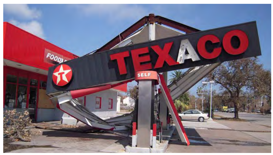
Galveston Island, 2008

The Tulane Environmental Law Program is one of the largest and most diverse in the United States. Each year, Tulane graduates more than forty Juris Doctor and a dozen Masters candidates with specialties in environmental law. What distinguishes Tulane's program in addition to the experience of its faculty is the scholarship of its journal , the strength of its clinic , the projects of its institute , and the momentum provided by an engaged group of students . These five components of Tulane's program – in the extraordinary setting of Post-Katrina New Orleans, the Lower Mississippi River and the Gulf Coast – provide a unique academic experience for those with an interest in environmental law and sustainable development policy. For more information, contact the Law School's admission office at John Giffen Weinmann Hall, Tulane University, 6329 Freret Street, New Orleans, LA, 70118, 504.865.5930, or its web site at www.law.tulane.edu.