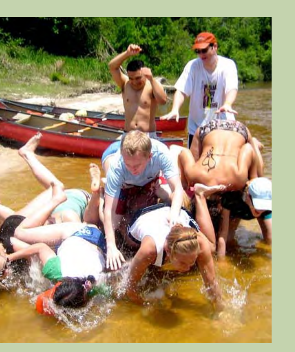
five seconds later...