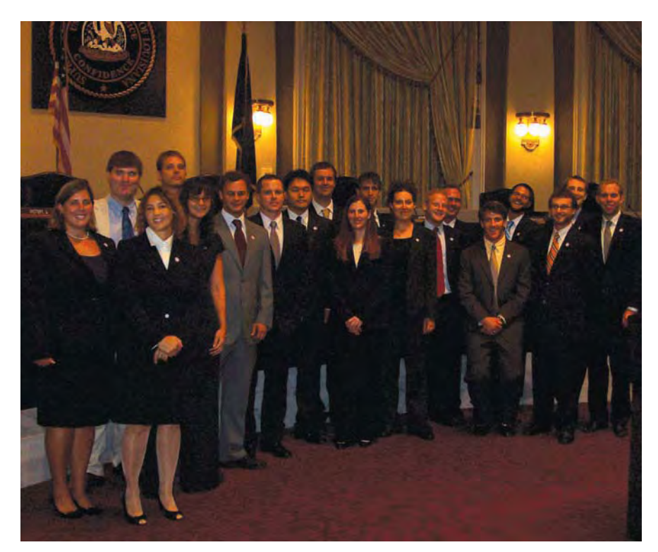
TLS Environmental Law Clinic Student Attorneys 2008

In re: Louisiana Department of Environmental Quality Permitting Decision: Permit for Louisiana Generating, L.L.C. Big Cajun 1 Power Plant Air Permitting Decisions (19th Jud. Dist., March 19, 2008) (Appealing decision granting Title V and related air permits).