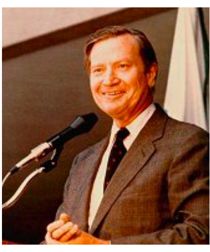
Russell Train, First Chair, President's Council on Environmental Quality, 1970 73

The Tulane Institute will summarize the results of the Mount Vernon colloquium in a report that will be made available to members of Congress, members of the transition team of the President-elect, and to the general public.